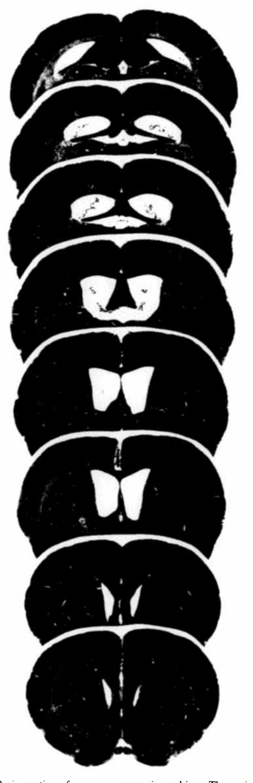
FIG. 3. Brain sections from a representative subject. The entire septal complex is destroyed (including the lateral, medial, and triangular subdivisions) with consequent ventriculomegaly. Secondary atrophy of hippocampal-fimbrial fibers is also evident.

groups were therefore combined into a single control group for subsequent analyses. Similarly, there were no cohort differences on either task, nor were there any significant statistical interac-